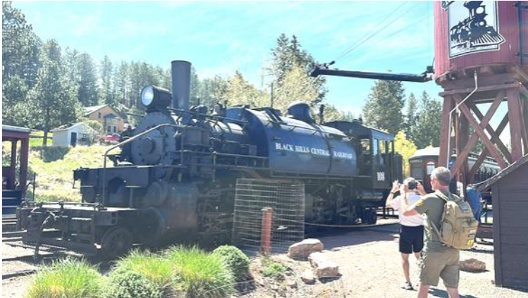
Photo report from the RMR Convention in South Dakota